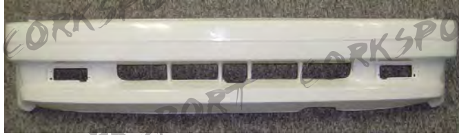
86- 92 B-Series FRP Front Bumper Install instructions