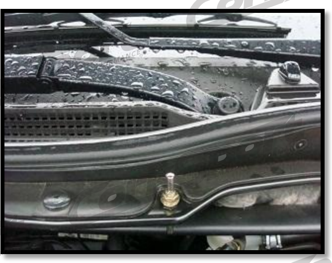
Cx-5 (figure 1e)