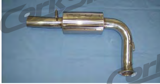
Drivers Side Muffler